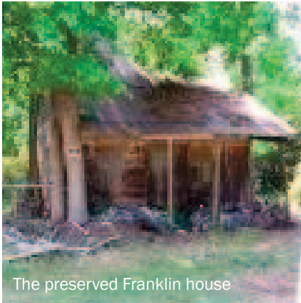
The preserved Franklin house

Among Cary’s historic structures that have been saved by moving are the Lane Bennett house (moved to Raleigh), the Franklin house (moved to Apex), the Upchurch house and the Waldo house. Historic resources that were preserved in place include the Richard house, the Guess-Ogle house and of course the Page-Walker Hotel. Sadly, at least one Cary property, the Mayton house, was demolished after it was moved; other properties, including the Lovie Jones house, Green Level community store, the A.M. & Vallaria Council farm, Barbee-Williams farm, Sears farm and others, have been lost without pursuing alternatives to demolition.