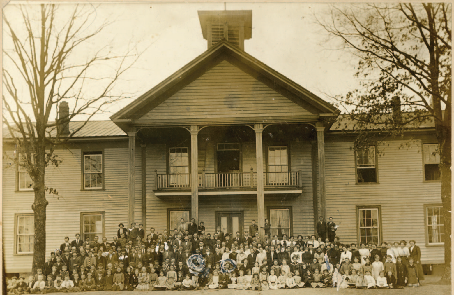
Cary High School 1911