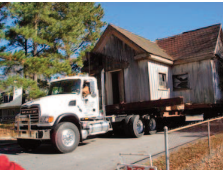
Relocating the Waldo house, Cary, 2016

Preserving historic structures is important to a community’s identity. The Friends will continue to advocate to preserve those structures in place. “Move it or lose it” is a last resort; we hope our community can instead evolve to “Repurpose it and keep it.”