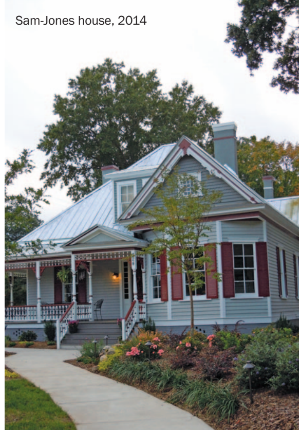
Sam-Jones house, 2014