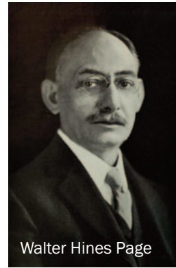
Walter Hines Page

said that Cary was unique among Wake County towns, maintaining a spirit and aire over time. Perhaps we had shared the same part of our individual lives in a time-unchanged place. Perhaps I would recognize this young