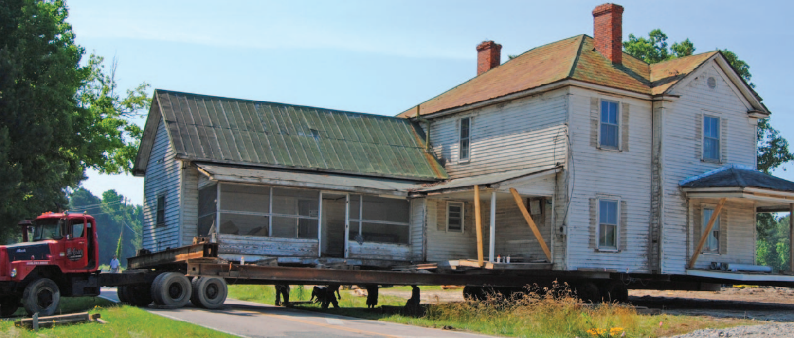
Relocating the Upchurch house, Raleigh, 2015

The Friends want to preserve Cary's history, and a big part of that is preserving our architectural history. Cary has experienced rapid growth for decades, and "progress" often means that historic structures are placed in jeopardy of new development. The good news is that many developers now understand that Cary values the preservation of historic structures, and they often propose to preserve those structures. In many cases, that offer of preservation involves moving the historic resource to some other site. Although this is clearly better than losing our historic structures to demolition, it is not ideal.