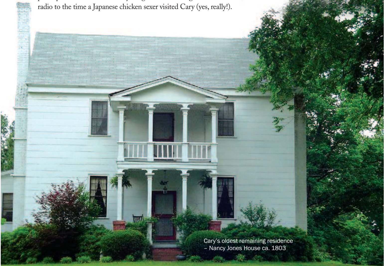
Cary's oldest remaining residence - Nancy Jones House ca. 1803