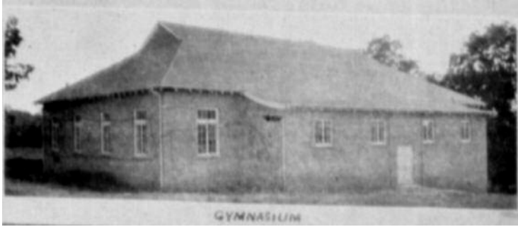
Cary High School Gym, ca. 1930s