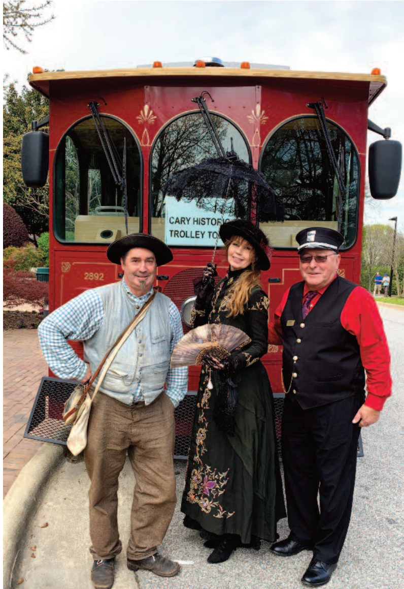
You never know who you'll meet on a Cary historic trolley tour. Sometimes visitors from the 1800s are on board!

Riders come away with an awareness of how Cary developed through the years, the role that its geographic location played in its founding, and the influence of the people who settled and were raised here throughout various eras.