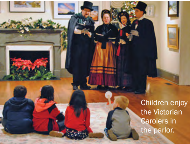
Children enjoy the Victorian Carolers in the parlor.