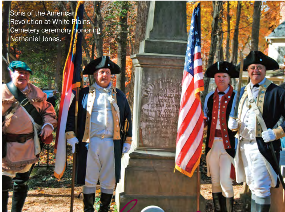
Sons of the American Revolution at White Plains Cemetery ceremony honoring Nathaniel Jones.

In addition to touring the Page Educational Garden, including a close-up look at the historic 1850s Page smokehouse, you can watch herb cooking demonstrations and stroll through booths selling a variety of herbs, crafts, native plants, perennials, garden products and even lunch. Learn more on page 4.