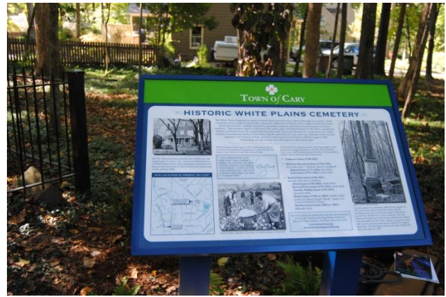
New interpretive sign at White Plains Cemetery.