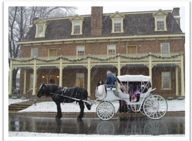
Horse-drawn carriage at last year's Holiday Open House at the Page-Walker Arts & History Center.

Learn about century-old holiday traditions while touring Cary's own 1868 historic hotel. Enjoy Victorian Carolers, sing Christmas carols around the piano or enjoy a free horse-drawn carriage ride. Enjoy holiday refreshments and view historic rooms decorated for the season by the Friends of the Page-Walker Hotel. Fun for the whole family.