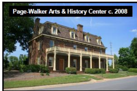
Page-Walker Arts & History Center c. 2008