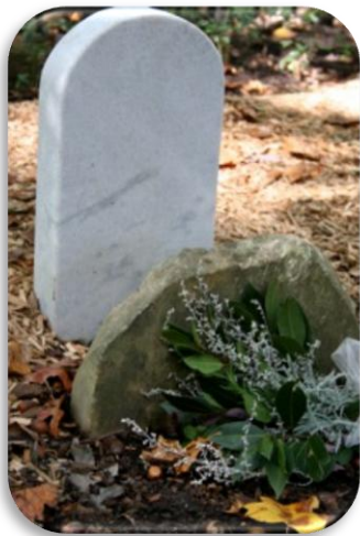
New marble companion marker for original stone marker.