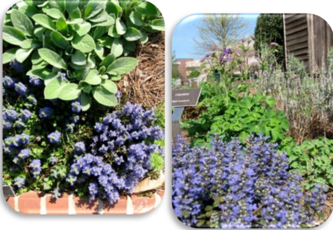
Lamb's ear and ajuga (left); columbine & ajuga, with smokehouse in background (right).